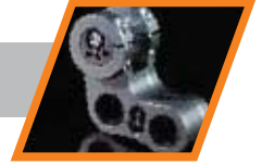
height adjustable swing-arm link