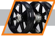
carbon wheels and mounting kits