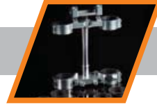
3-way adjustable triple clamp system